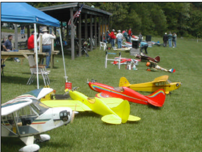
(left) This view of the pit area shows two of Bob Gensler's own-design QD models in the foreground, flanked by two Piper Cubs.